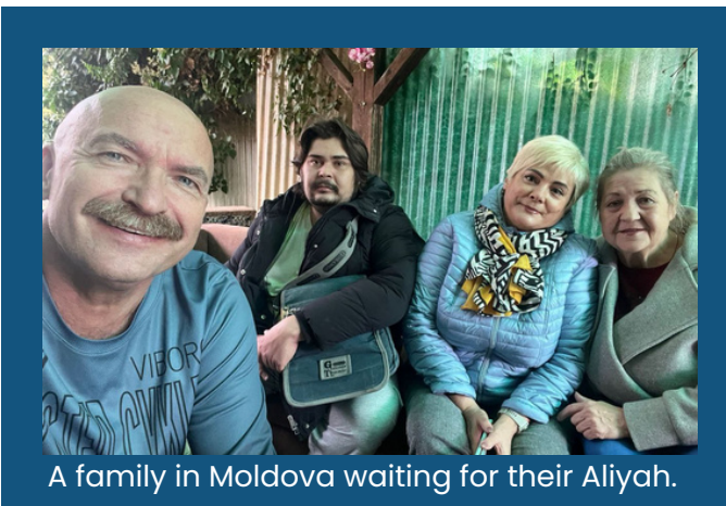
A family in Moldova waiting for their Aliyah.